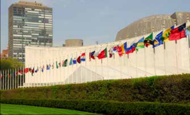
United Nations Headquarters - New York