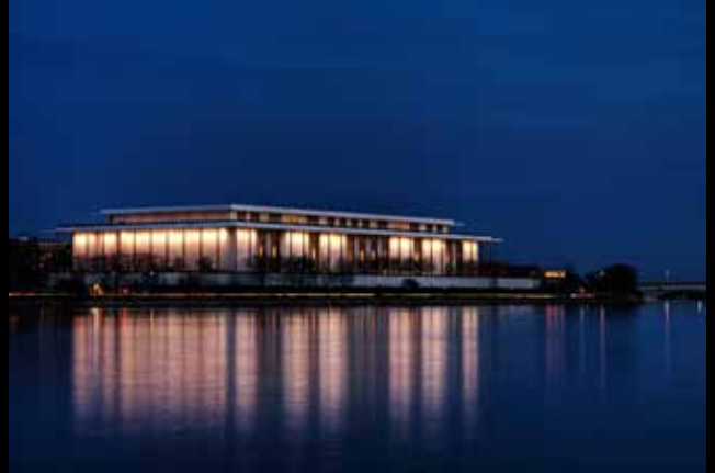
John F. Kennedy Center for the Performing Arts - Washington DC