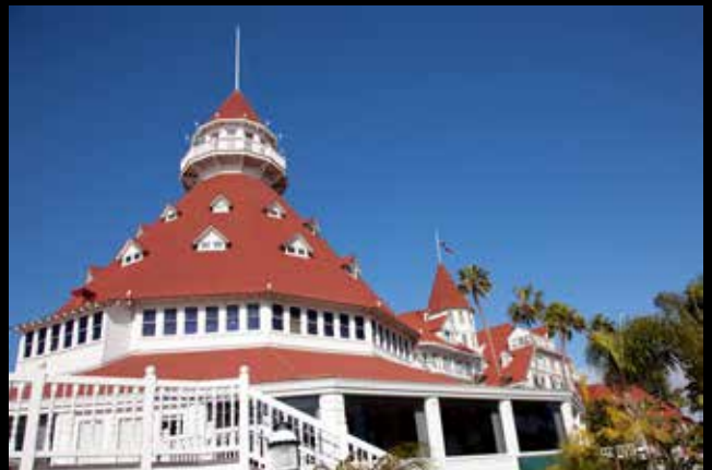
Hotel del Coronado - Coronado