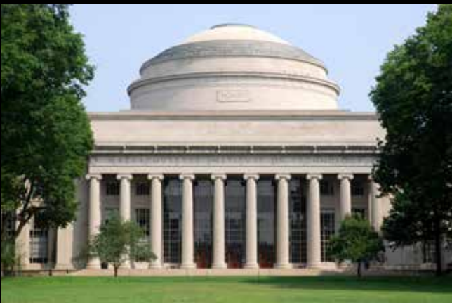
MIT - Cambridge