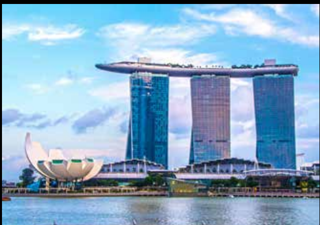
Marina Bay Sands Resort & Casino - Singapore