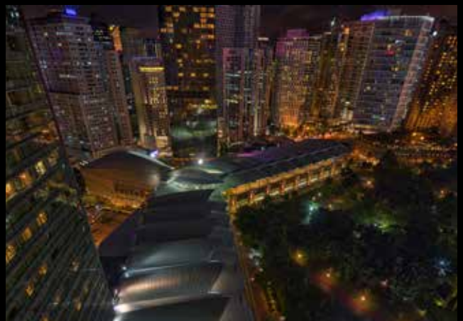
Kuala Lumpur Convention Centre - Malaysia