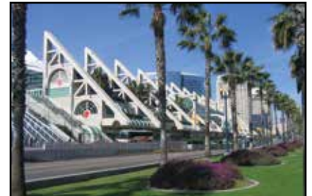
San Diego Convention Center