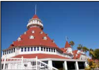
Hotel del Coronado

Ascension lifts can be found at these world-class facilities: